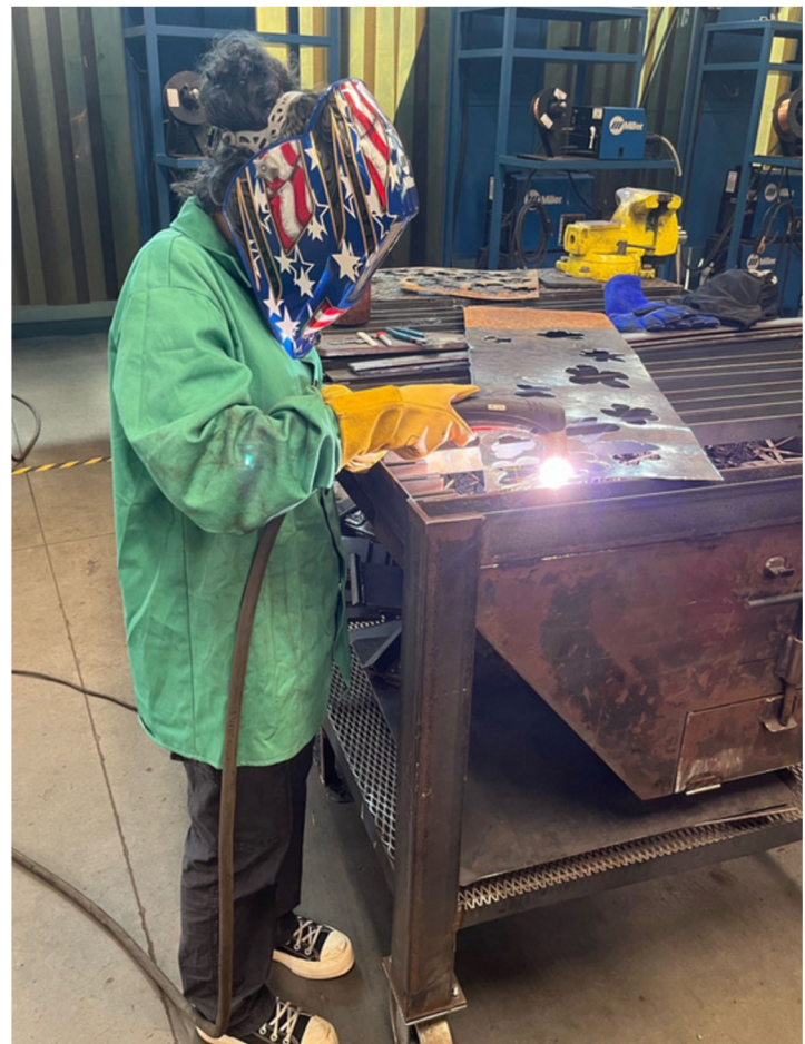
Above, a young student participating in the Faculty/Staff Innovation Grant-financed "Girls Take Over Tech" camp.