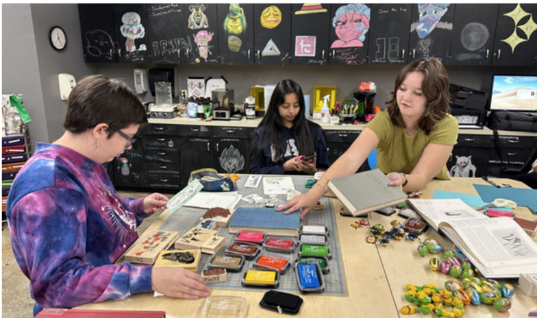
Above, campers learned about graphic design while using the grant-financed Makerspace.

The ACC Foundation funded 14 Innovative Faculty and Staff grants totaling $70,709 for 2024-2025. Hundreds of students at Alamance Community College, Alamance-Burlington Schools and in the community will be impacted by these innovative projects which range from student camps to course delivery enhancements.